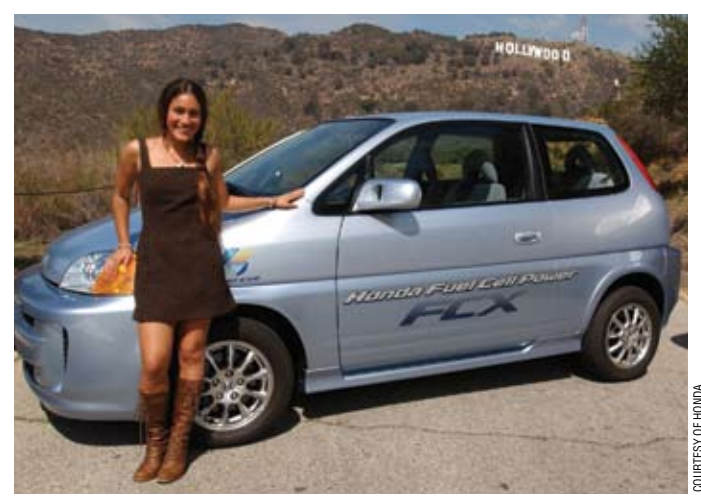
Actress Q'orianka Kilcher has become the youngest customer to lease Honda's environmental status symbol, the hydrogen-powered and zeroemissions FCX fuel cell vehicle. Kilcher is the first person ever whose first car runs on hydrogen. She took possession of the FCX on March 7, 2007, in Universal City, California.

This system isn't perfect, though. You still need a source of electricity if you want to use the fuel cell to make methanol fuel. This is the same problem scientists run into when they try to make hydrogen fuel from water.